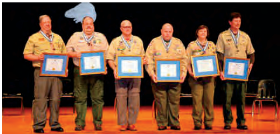
The 2015 Class of Silver Bearers