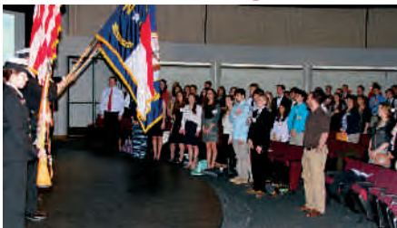
Opening ceremony for the 5th annual Pangea MUN conference led by West Caldwell HS NJROTC.